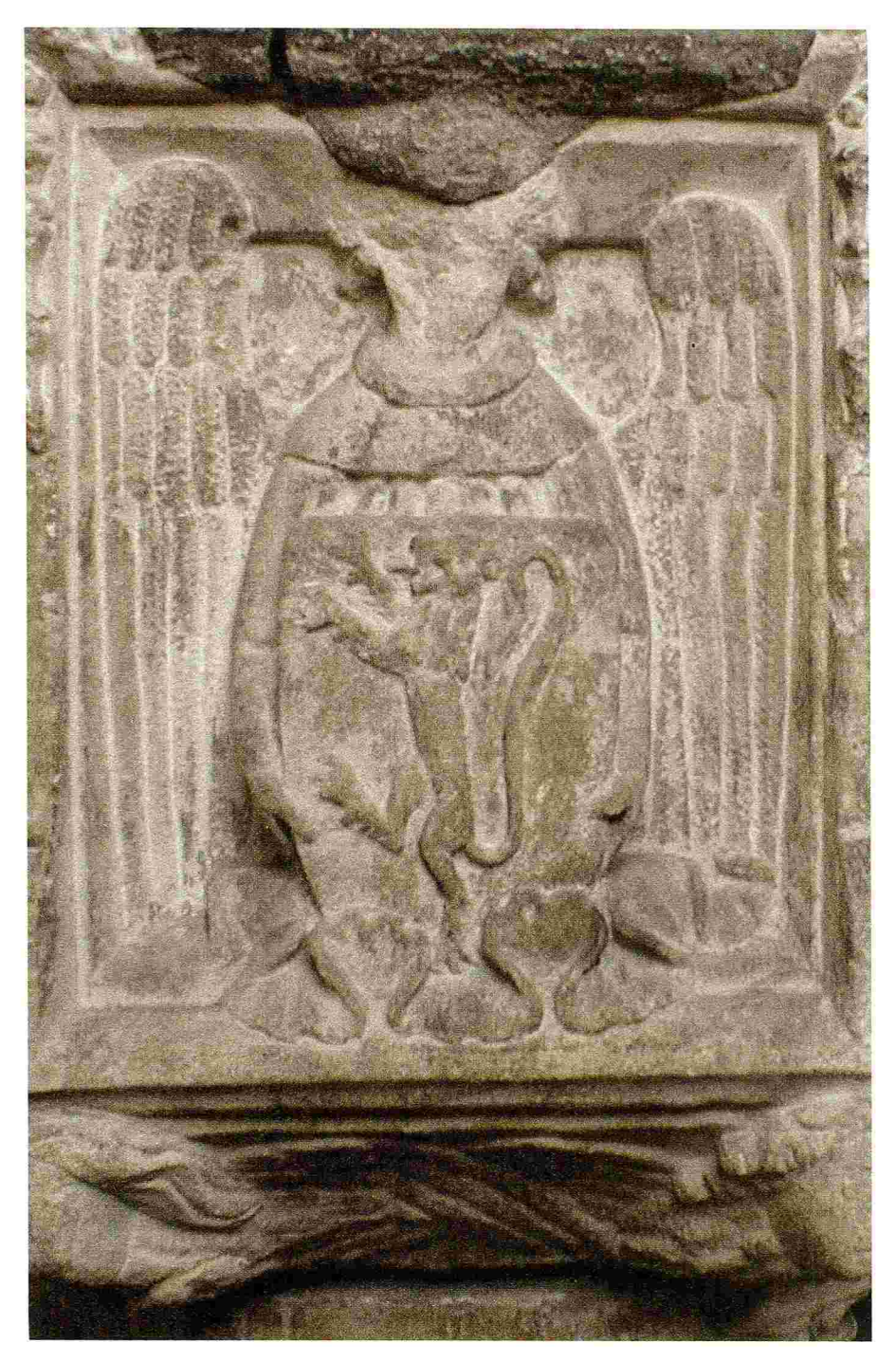
FIG. 118 - The lion on the font in the church of St Mary at the Quay in Ipswich.