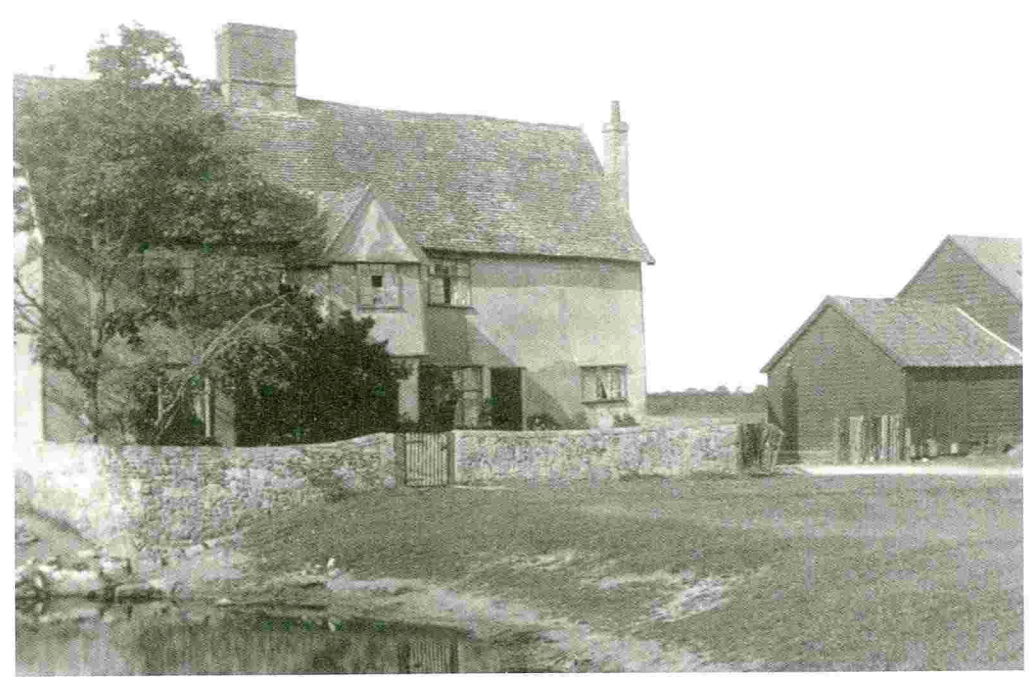
FIG. 116 - "Old Hall Farm" photographed by Charles Emeny in 1887. This is now Old Hall, 37 High Road, and still has the wall round the front garden incorporating stones from the medieval Old Hall.