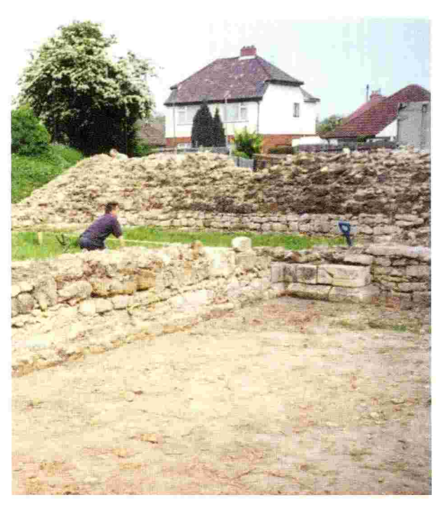
FIG. 112 – The remains of the north wall seen beyond the long cast wall. At the right the solid base of the original doorway is overlapped by the start of the porch wall