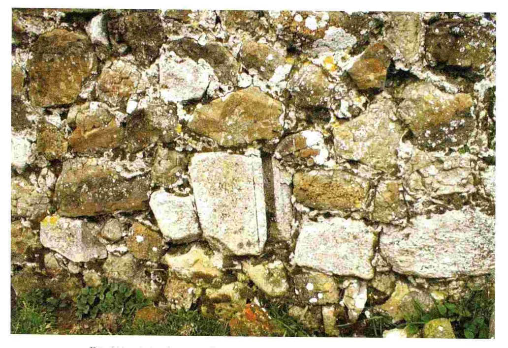
FIG. 114 - A deeply cut medieval moulding incorporated in a later field wall.