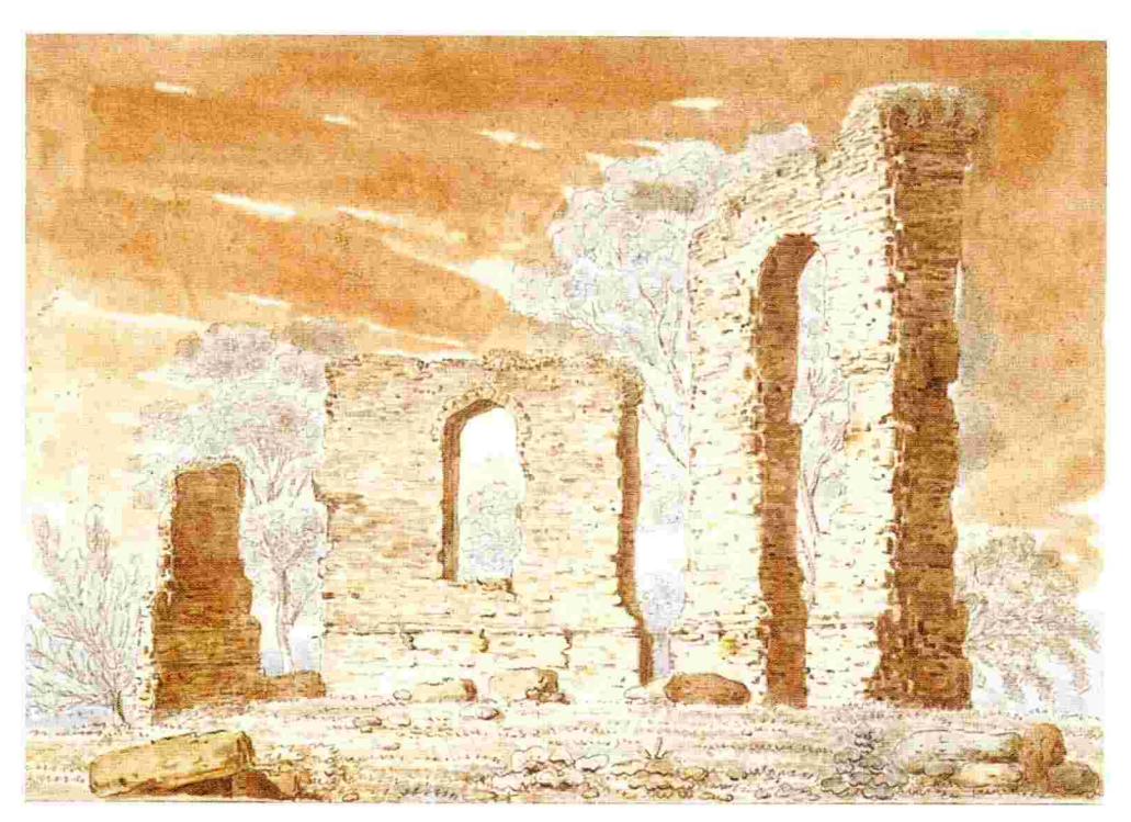
FIG. 111 – "Remains of the Manor House, Felixtow". This 18th-century view of the ruins is in the collections of Felixstowe Town Council.