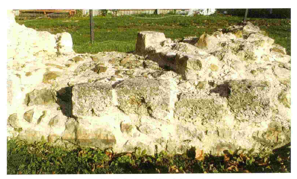
FIG. 115 - Blocks of tufa inside a window opening.