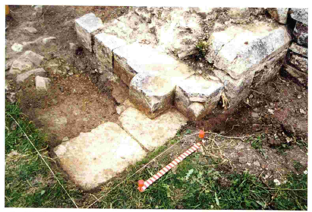
FIG. 113 – The detailed mouldings in the doorway with the stone threshold in the foreground are still in place. At the right the later stonework of the porch overlaps the plinth of the hall. This is the distinctive detail that identifies the possible master mason.